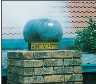
Chimney Champ extracts unwanted smoke effortlessly.