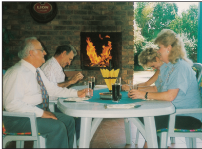
Chimney Champ transforms your entertainment area into a smokeless and relaxed environment.